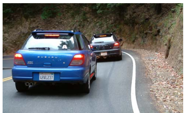
A seriously fun road: California's Highway 36